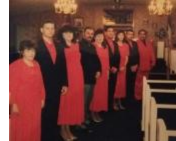
Singing Revelations, Golden Voices at Seedtime 1996 (16594)