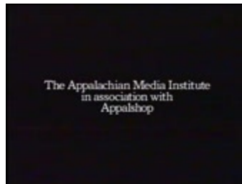
Colorblind (AMI) (ami.2013.1)