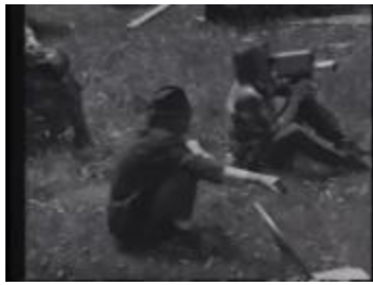
Dock Boggs Memorial Festival (9608)