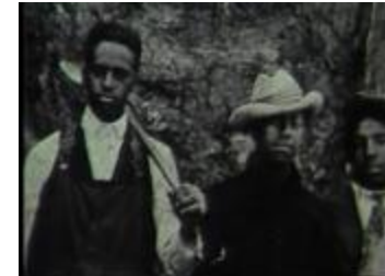
Cinchco: Story of a Mining Town (00000006)