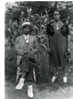
Portrait of couple with man sitting (pmc.0533)