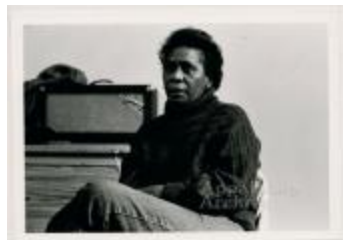
Coalmining Women production still (1- 18CMWM-1-4.jpg)