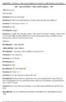
Interview with Collins and Effie Hollyfield (transcript) (ap_pmc_oh04_7ab)