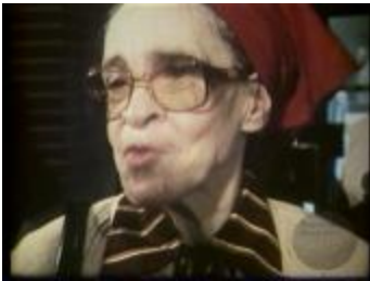
Headwaters: East Kentucky Social Club (2305)