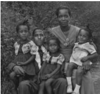
A couple with 3 of their daughters (pmc_0325)