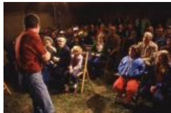
Performing Arts Story Circle (cip.2020.03.16)