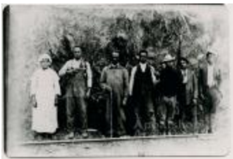
Cinchco: Story of a Mining Town production still (1-16CLINCH-1-1.jpg)