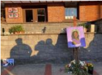
Breonna Taylor memorial in front of Whitesburg City Hall (cip.0003)