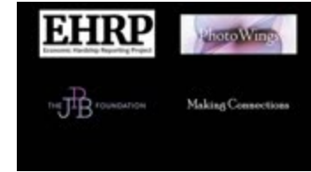
Justice For All (AMI) (ami.2016.3)