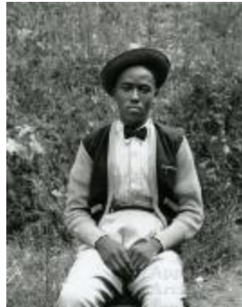
Exterior portrait of young man in hat (pmc0815)