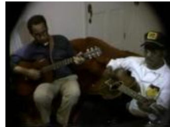
Headwaters: The Mountain Blues (2335)