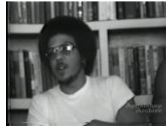
Incarcerated men at Wise County Correctional Facility, Unit 18 (9305)