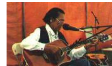
Etta Baker at Seedtime, 1989 (12719)