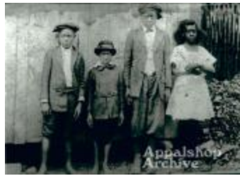
A group of children (1-23EVELYN-1-2.jpg)